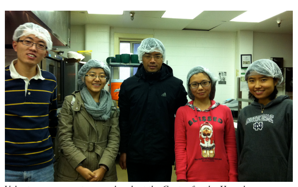
Volunteers prepare to serve lunch at the Center for the Homeless.

International Students Visit the Center for the Homeless